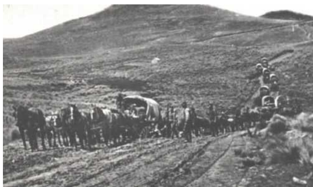
A horse drawn wagon train on the sodden Pigroot track near 'The Brothers'.

'The Brothers' are well known landmarks alongside today's sealed highway.